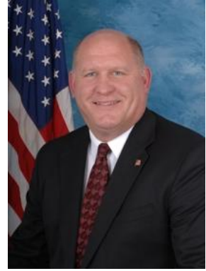
Rep. Glenn Thompson