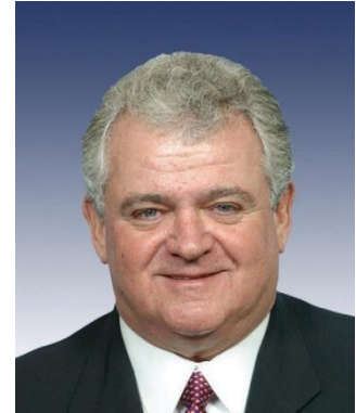
Rep. Robert A. Brady