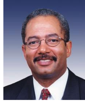
Rep. Chaka Fattah