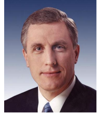
Rep. Tim Murphy