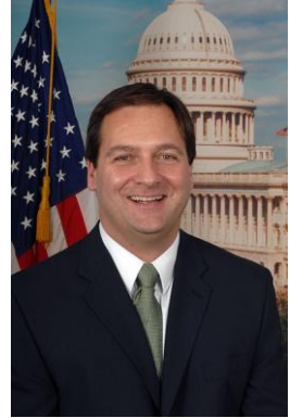
Rep. Christopher P. Carney