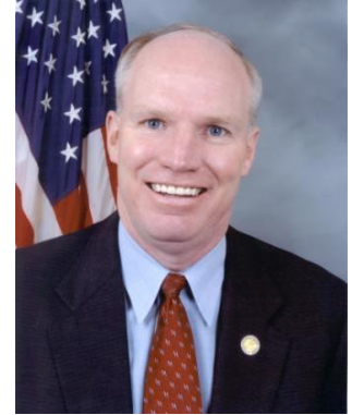
Rep. Tim Holden