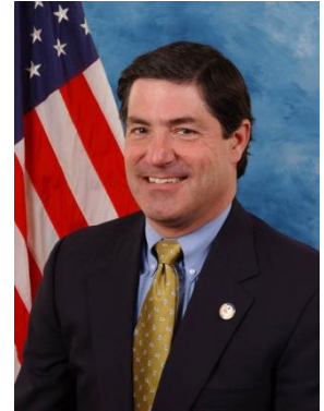
Rep. Jim Gerlach