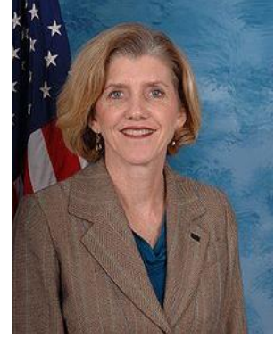
Rep. Kathy A. Dahlkemper