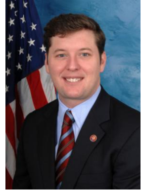
Rep. Patrick J. Murphy