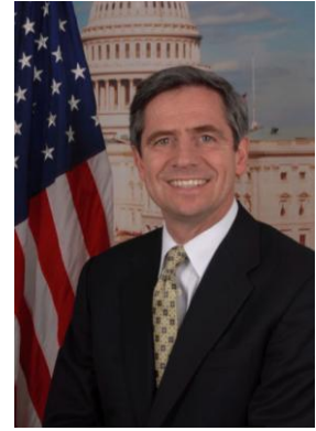
Rep. Joe Sestak