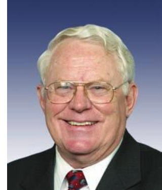
Rep. Joseph R. Pitts