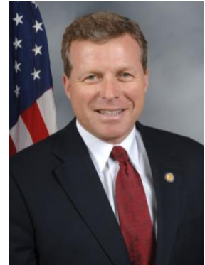
Rep. Charles W. Dent