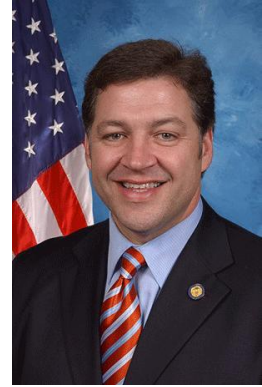
Rep. Bill Shuster