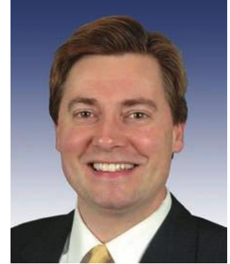
Rep. Jason Altmire