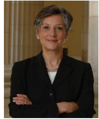
Rep. Allyson Y. Schwartz