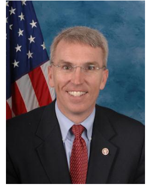
Rep. Todd Russell Platts