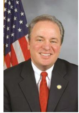
Rep. Michael F. Doyle